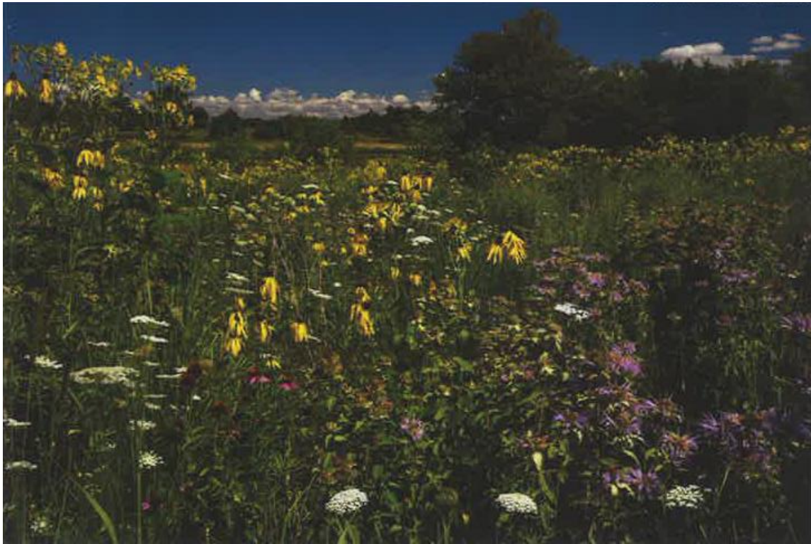
Prairie at Bunker Natural Area